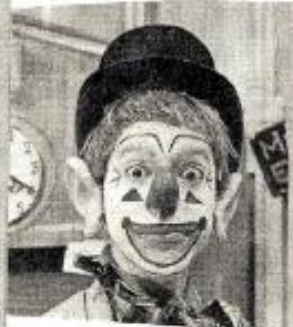
J. P. PATCHES—"You have built up a 'character-building' program that is enjoyable to both children and adults . . . a wonderful contribution to Seattle television." M. L. P.—Seattle, Washington