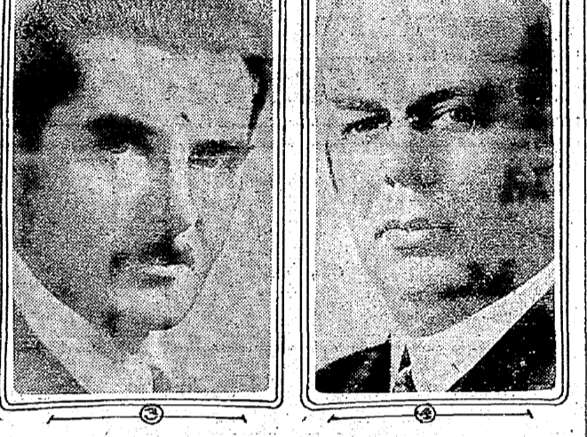
"Totem Broadcasters" Officials. These four men will guide the policy of the programs on the new radio station.

High-Class Programs Will Be Broadcast From Studio Located in Metropolitan Center; Plant on Harbor Island.